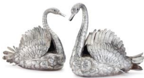
A PAIR OF PORTUGUESE LARGE SILVER TABLE SWANS MARK OF DAVID FERRARA, PORTO, POST 1938 PRICE REALIZED: $32,500 OVER 6X ESTIMATE