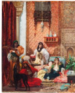
GEORGES JULES VICTOR CLAIRIN (1843-1919) THE SULTAN'S FAVORITES OIL ON CANVAS, 1875 PRICE REALIZED: $32,500 OVER 2X ESTIMATE