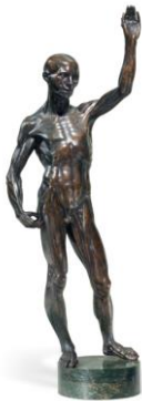
THE ESTATE OF KENNETH JAY LANE A PATINATED BRONZE ECORCHE FIGURE, PROBABLY ITALIAN 19 TH /20 TH CENTURY PRICE REALIZED: $87,500

EXCEEDS EXPECTATIONS NEARLY DOUBLING THE SALE'S OVERALL ESTIMATE REGISTERED BIDDERS FROM 34 COUNTRIES