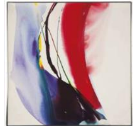
PAUL JENKINS (AMERICAN, 1923-2012) PHENOMENA X MARKS PRICE REALIZED: $41,250