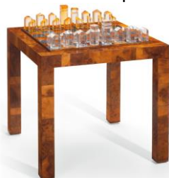
PAUL EVANS (1931-1987) CITYSCAPE GAME TABLE, PE-826, CIRCA 1978 PRICE REALIZED: $3,250