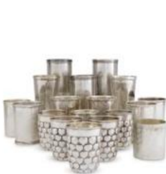
A GROUP OF EIGHTEEN SILVER BEAKERS 20TH CENTURY PRICE REALIZED: $25,000 OVER 15X ESTIMATE