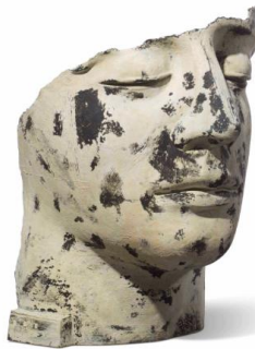
THE COLLECTION OF ARNOLD SCAASI AND PARKER LADD IGOR MITORAJ (POLISH, 1944–2014), SONNO TATUATO EXECUTED IN 2002 PRICE REALIZED: $81,250