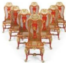
A SET OF EIGHT ITALIAN SCARLET AND GILT-JAPANED SIDE CHAIRS ROME, FIVE SECOND QUARTER 18TH CENTURY, THREE OF A LATER DATE PRICE REALIZED: $37,500